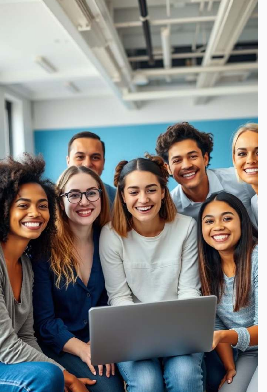
Team of Professionals Meet Our Professional Team