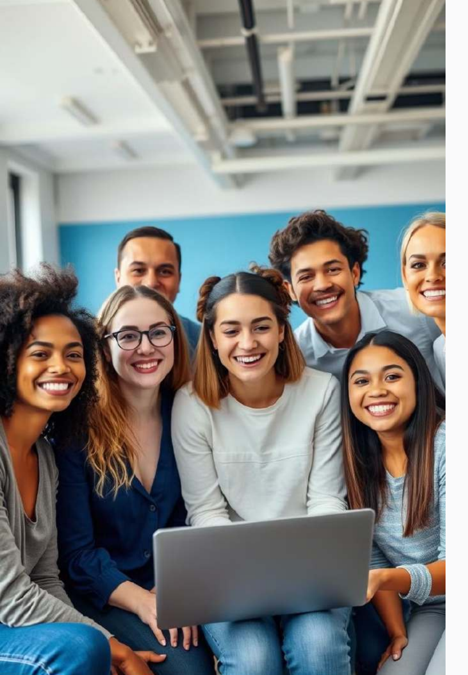
Team of Professionals Meet Our Professional Team